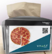
Table Top Dispenser