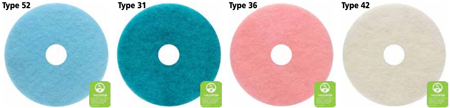
Blue Velvet UHS Soft

Removes black marks without removing the finish. Achieves a higher gloss level in heavy traffic areas. The UHS pad will yield more time between recoatings. Use with machines up to 3000 RPM.