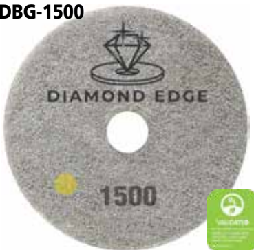
1500 Grit Diamond Edge Pad

This diamond pad is for maintained floors. It prepares floors for high polishing while removing fine scratches. The 1500 can be used as your regular maintenance pad.