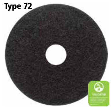
Type 72 Black Strip

This pad is designed for wet scrubbing or medium-duty spray cleaning. Removes heavy dirt and scuff marks on most floor surfaces. This pad will remove the top layer of floor finish.