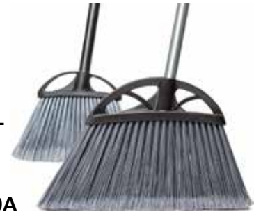
B441L B410A Angle Brooms

These high-quality brooms are made with 100% treated corn, which is mold and mildew resistant. These traditional brooms are a must in malls, businesses and workshops. Used with dustpans for continuous cleaning or by themselves. Each broom comes protected with a poly sleeve.