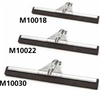
M10018 M10022 M10030 Moss Foam Rubber Squeegee

Soft double foam rubber for uneven, rough and smooth surfaces. Ideal for markets, warehouse, and foodservice facilities. Quality construction and excellent value. Double blade is 3/4" thick. Uses a standard 15/16" diameter handle.