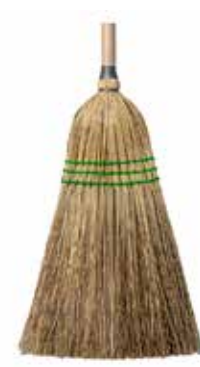
B410 Maids Broom

For household, janitorial, retail stores and light-duty sweeping. A good value corn broom. Clear natural finish wood handles. Each broom comes protected with a poly sleeve.