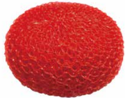
PS700 Plastic Mesh