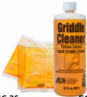
GC-36 GC-QT Griddle Cleaner Liquid

Liquid Griddle Cleaner: Pre-mix of griddle cleaning liquid is fast and safe for use on food contact surfaces. Loosens and lifts grease and oil for easy removal. Available in 3 oz. portion packs or quart bottles.