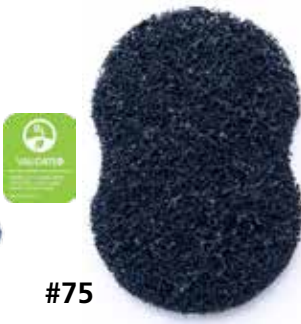
#75 Sapphire Max Power

Sapphire Max Power Pad is the toughest of them all. Will not scratch like a Metal Scrubber. Open weave design for easy rinsing. Pad is 6" x 4" x 5/8" thick. Removes the toughest burnt-on foods.