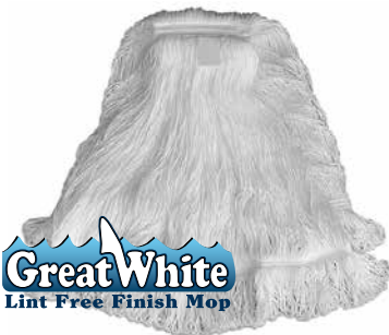
GreatWhite Nylon Filament Finish Mop

Filament Finish Mop is the ultimate for laying floor finish. Non-absorbent for smoother more even coats with less effort. Greater shine with no streaks. Looped-ends keep mop lasting longer. Each mop is individually packaged. Narrow-band is 1-1/4". Wide-band is 5" coated mesh.