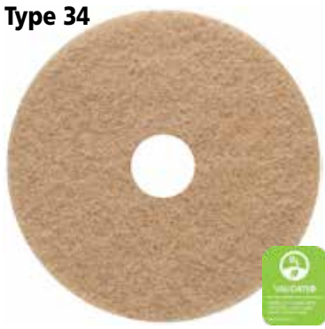
Type 34 Tan Buffer