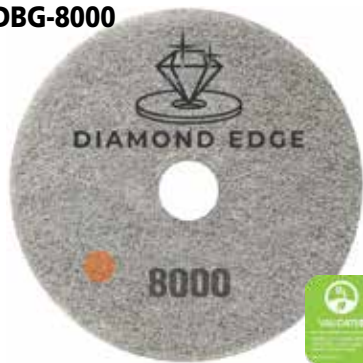
8000 Grit Diamond Edge Pad

This diamond pad produces and maintains a "wet-look" shine. Use it as your normal maintenance pad on concrete, stone, terrazzo, tile and even VCT.