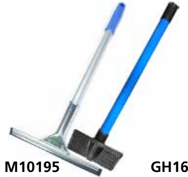
M10195 GH16 Griddle Squeegee Griddle Pad Holder

This grease & heat resistant griddle squeegee helps remove griddle cleaner liquid and debris after cleaning is completed.