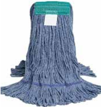
Blue 100% Synthetic Healthcare Antimicrobial