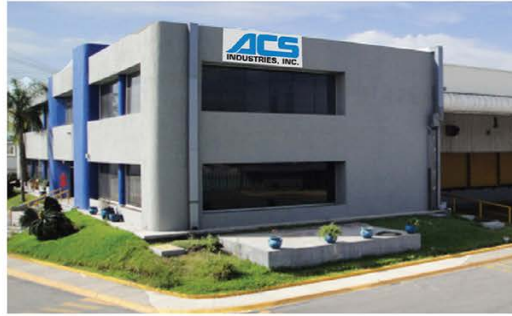
ACS Cleaning Products Manufacturing and Distribution Apodaca, Mexico