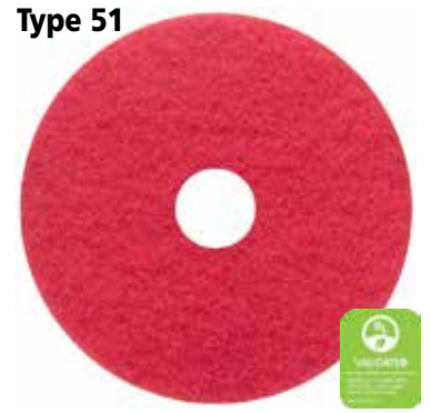
Type 51 Red Buffing

An aggressive open weave pad that is soft and thick. Designed to work with all types of floor finishes. It allows wax dust to be absorbed up inside the pad and not be spread around the floor surface.