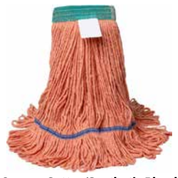
Orange Cotton/Synthetic Blend, Wide Band, Looped

Versatile, cotton/synthetic blend requires little break-in, is durable and is designed for most general purpose applications. Looped-ends keep mops from fraying and reduces linting. Tailband provides wide surface coverage without gaps while preventing tangles. Sewn-in label for easy identification and re-order. Each mop is individually packaged. The wide headband is 5" vinyl coated mesh and increases the life of the mop.