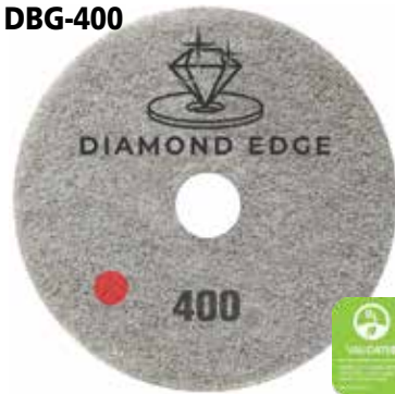
400 Grit Diamond Edge Pad

An aggressive diamond pad to be the next step used on damaged floors or after grinding. For heavy-duty removal of scratches and discoloration of the surface.