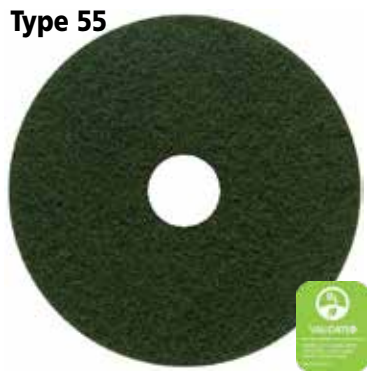
Type 55 Green Scrubber