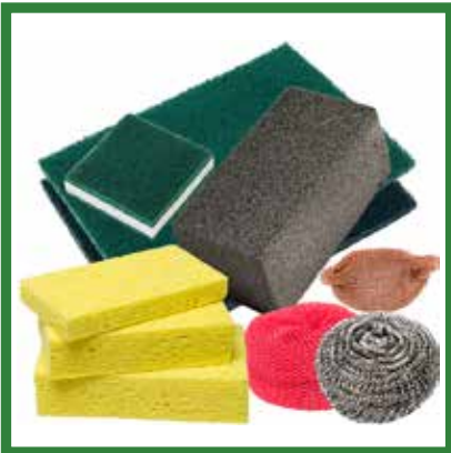
Scrubbers, Sponges, Hand Scouring & Grill Cleaning