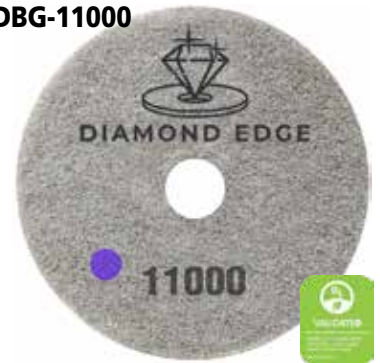
11000 Grit Diamond Edge Pad

The 11000 grit diamond pad produces the ultimate "wet-look" shine. Use it as your normal maintenance pad on concrete, stone, terrazzo, tile and even VCT.