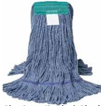
Blue Cotton/Synthetic Blend, Wide Band, Looped