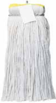
Rayon, Screw-Type, Cut-End

Screw-Type lay flat for more efficient mopping. Quick absorption, mildew resistant and fast-drying. Fast, easy to change mop heads. Each mop is individually packaged. Sewn-in label for easy identification and re-order. Narrow-band is 1-1/4" vinyl coated mesh.