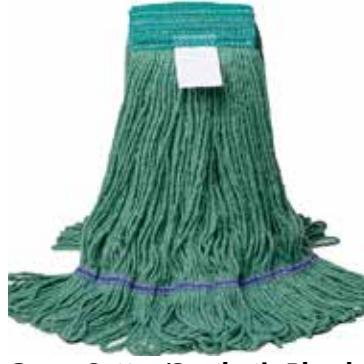
Green Cotton/Synthetic Blend, Wide Band, Looped