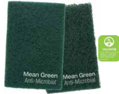
#96A #86A Mean Green® Anti-Microbial Hand Pads

All-purpose maroon pad made of tough non-woven material. Impregnated with abrasive grain and bonded with synthetic resin. Ideal for removing rust and corrosion in surface preparation and cleaning. Item No Size Pk Case Wt Cu 617 6"x 9" 6/10 4.00# 0.65 617-20 6"x 9" 1/20 1.70# 0.26