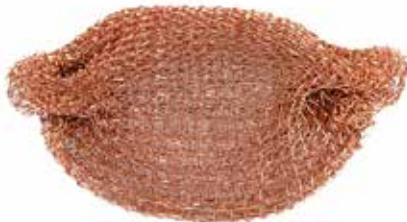
3A Copper Mesh