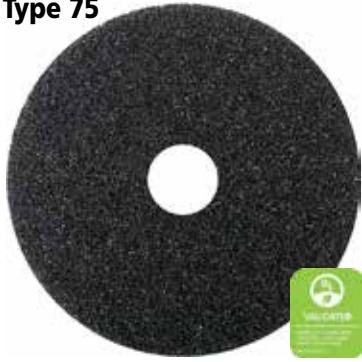
Midnight Super Strip

Highly abrasive and tear resistant with heavy-duty stripping power. Unique fiber blend for long lasting durability. Open weave design allows for flow through without build up and loading. Pads are 5/8" thick. Use with 175 – 300 RPM machines.