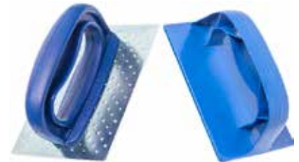
GH100 676 Griddle Pad/Screen Holders

The GH100 metal base holds grill pads and screens. It protects hands from burns and speeds cleaning. The heat-resistant and high-impact plastic handle stands up to 400°F.