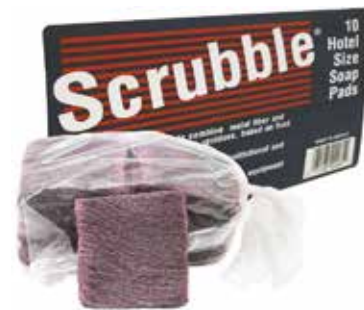
ISP01PB Bag 24-002 Box Soap Pads

Soap Pads are fully saturated with cleaning formula for greater sudsing and cleaning power. Large hotel size fits in the palm of the hand. Tackles tough baked-on foods and other cleaning problems. Available poly bagged or boxed.