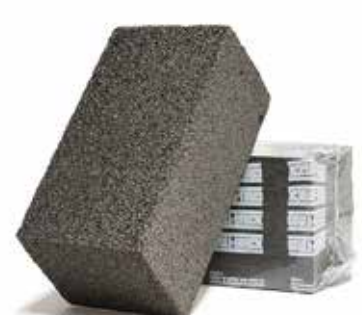
GB12-TSH Grill Brick

Scrubble® Products is the premier supplier of grill bricks to the foodservice industry. This product cleans HOT residue-encrusted grills quickly with little effort. Will neither scratch grill nor lift surface cure. Individually wrapped grill brick.