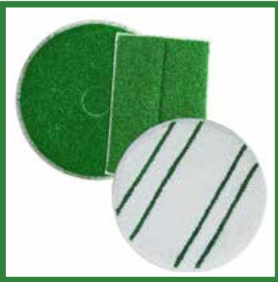
Bonnets & Specialty Pads