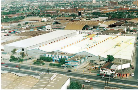
ACS Internacional S. de R.L. de C.V. Monterrey, Mexico Plant # 1

One New England Way, Lincoln, RI 02865 800-222-2880