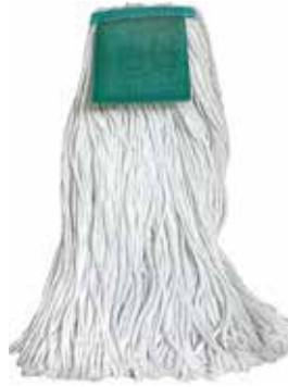
Rayon, NB, Cut-End Power Scrubber

Quick absorption, mildew resistant and fast-drying. Narrow-band construction with cut ends. Narrow-band is 1-1/4" vinyl coated mesh with a non-woven scrubbing pad sewn in. Not recommended for laundering.