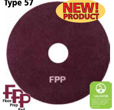
Maroon FPP 2.0-Dry Strip

Maroon FPP is a chemical-free stripping pad. Best used for dry stripping before coats and refinishing of wood/vinyl floor surfaces. Thin Line pads are 3/8" thick and are packed 10 per case. Use with 175 – 300 RPM machines.