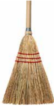
B414 Lobby/Toy Broom

These high-quality brooms are made with 100% treated corn, which is mold and mildew resistant. These traditional brooms are a must in malls, businesses and workshops. Used with dustpans for continuous cleaning or by themselves. Each broom comes protected with a poly sleeve.