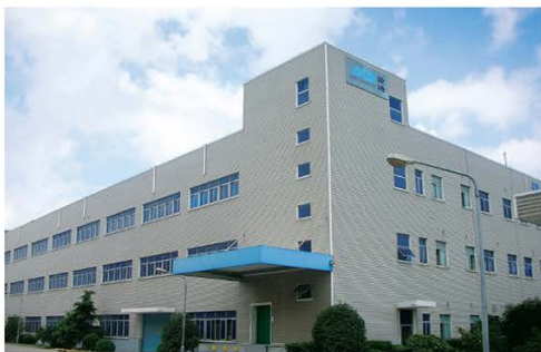
ACS Internacional (Shanghai) Co. LTD Shanghai, China