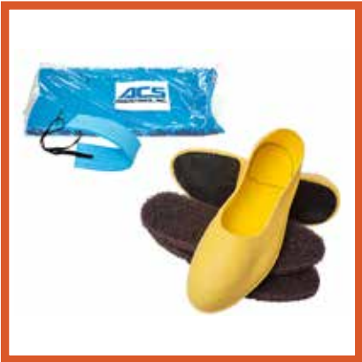
Safety Products & PPE