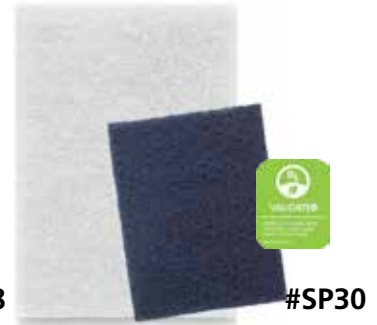
#98 #SP30 Light Duty White Scratchless Power Pad

Holder: Hand-size holder with gripping fingers. Holds pads firmly in place. Light-Duty White: Cleaning and buffing windows and ceilings. Ideal for reaching corners while floor buffing. Medium-Duty Red: General purpose cleaning and scrubbing of baseboards, floors and equipment. Heavy-Duty Black: Very aggressive for removing finish build-ups and other tough floor applications. Item No Type Pk Case Wt Cu 676 Holder 1/10 2.5# 0.32 90-030 White Pad 1/40 1.0# 0.42 90-051 Red Pad 1/40 1.0# 0.42 90-072 Black Pad 1/40 1.0# 0.42 677 Kit 1 ea. 1.0# 0.42