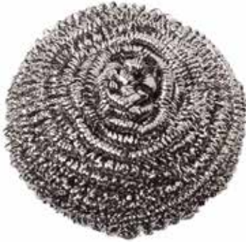
300 Series Stainless Steel