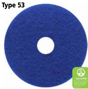
Type 53 Blue Cleaner