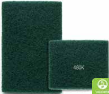
#96 General Purpose Green Hand Pad

Poly blend construction, medium abrasive, and general purpose cleaning. Designed for most daily cleaning jobs; rinses clean and lasts longer. Cleans equipment, kitchenware and other durable surfaces. Hand-size eliminates cutting or folding the larger pad. Item No Size Pk Case Wt Cu 96-601 6"x 9" 1/20 1.70# 0.26 S096 6"x 9" 6/10 4.00# 0.65 480K 4-1/2"x 6" 1/60 2.15# 0.41