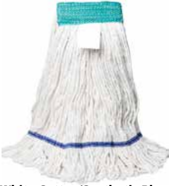
White Cotton/Synthetic Blend, Wide Band, Looped