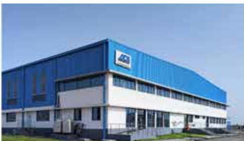
ACS Industries India Pvt. LTD Pune, Maharashtra, India

For additional information, visit our website: www.acs-cp.com Toll Free: 800-222-2880 US