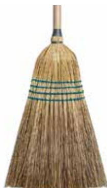
B408 Maids Broom

For commercial to janitorial sweeping. This is the ideal broom for most general duty applications. Each broom has a gloss wood natural handle and is protected with a poly sleeve.