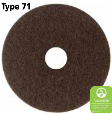
Type 71 Brown Strip