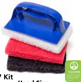
#677 Kit Hand Size Utility Pads With Holder

Light-Duty White: Cleaning and buffing windows and ceilings. Ideal for reaching corners while floor buffing. Medium-Duty Blue: General purpose cleaning and scrubbing of baseboards, floors and equipment. Heavy-Duty Brown or Black: Very aggressive for removing finish build-ups and other tough floor applications. Swivel Joint Holder: Features a hook & loop design for positive traction. The 180° swivel joint allows for reaching difficult areas. Use with any std. threaded handle. Item No Type Size Pk Case Wt Cu 621 White Pad 4-1/2"x10"x 1" 4/5 1.7# 0.42 626 Blue Pad 4-1/2"x10"x 1" 4/5 1.7# 0.42 631 Brown Pad 4-1/2"x10"x 1" 4/5 1.7# 0.42 672 Black Pad 4-1/2"x10"x 1" 4/5 1.7# 0.42 619 3-pc. Kit A 4-1/2"x10" 1 ea. 0.5# 0.09 618-10PK Holder Only 3-5/8"x9"x1-1/2" 1 ea. 0.7# 0.14