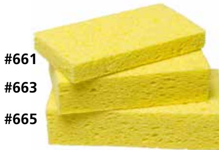
Cellulose Sponge Blocks

Large Cellulose Block Sponge Pure cellulose sponge in 3 most popular sizes. Rinses and cleans easily. Excellent for quick and easy clean-ups. Anti-microbial treated.