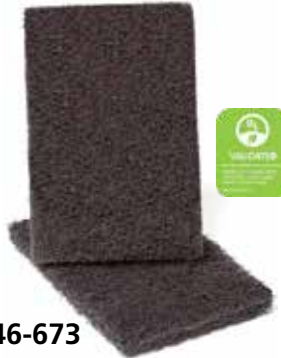
46-673 Grill Pads

This is a dual-purpose 4" x 6" pad. Used with grill screen holder, the grill pad maximizes screen life and minimizes loading. Used alone, with holder, grill pad adds final polish to make future cleaning easier.