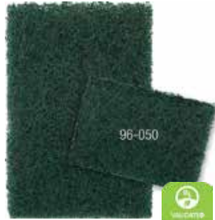
#86 Heavy Duty Green Hand Pad

Poly blend construction, medium abrasive, and general purpose cleaning. Designed for most daily cleaning jobs; rinses clean and lasts longer. Cleans equipment, kitchenware and other durable surfaces. Hand-size eliminates cutting or folding the larger pad. Item No Size Pk Case Wt Cu 96-601 6"x 9" 1/20 1.70# 0.26 S096 6"x 9" 6/10 4.00# 0.65 480K 4-1/2"x 6" 1/60 2.15# 0.41