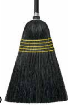
B420 Treated Black Corn

Quality broom for use in factories or warehouses. Each broom has one wire band for reinforcement. Clear natural finish wood handles. Each broom comes protected with a poly sleeve.