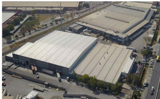
ACS Cleaning Products Manufacturing and Distribution Apodaca, Mexico