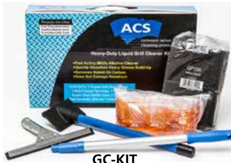
GC-KIT Heavy Duty Liquid Grill Cleaner Kit

This grill cleaning kit includes grill cleaning pads and holder, grill cleaning liquid packs and a squeegee with a handle. The fast acting, mildly alkaline cleaner will quickly dissolve heavy grease build-up and baked-on carbon. It will not damage aluminum.