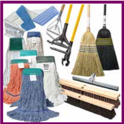
Mops, Brooms & Handles