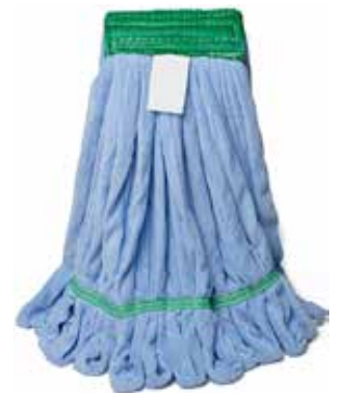
Tube Style Microfiber Mop

SUPER ABSORBENT LARGE SIZE Blue microfiber tube style mop. 3x the durability of traditional mops and withstands over 200 launderings. Tube style does not drag and will not unravel.