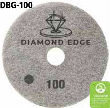
100 Grit Diamond Edge Pad

Our most aggressive diamond pad. To be used on damaged floors or after grinding. For heavy-duty removal of scratches and discoloration of the surface.