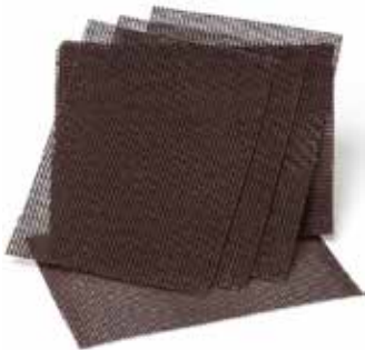
20-682TSH Grill Screens

Tough aluminum oxide abrasive eliminates the toughest burnt-on foods. Open mesh screen resists clogging. Fast cleaning action leaves no mess on the grill.