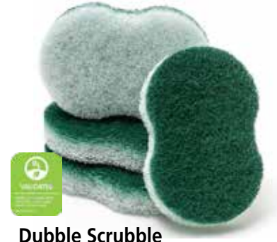
Dubble Scrubble Dubble Scrubble Hand Pad

A two-sided, non-woven hand pad. The white light-duty side is great for delicate surfaces that can scratch easily, such as Teflon®, Silverstone®, Plexiglas® or other sensitive surfaces. The green medium-duty side is great for scrubbing pots & pans or tough stains that need extra power. 6"x4"x5/8"