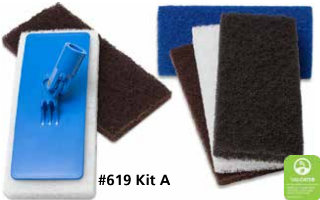
#619 Kit A Utility Pads With Holder Replacement Pads

Anti-microbial treatment throughout the pad inhibits the growth of odor causing bacteria, fungus, mold and mildew in the pad. Ideal for everyday scouring jobs. Perfect for cleaning vegetables. Removes baked-on and burnt-on foods. Use where heavy aggressive action is required. Item No Size Pk Case Wt Cu 96-601A 6"x 9" 1/20 1.7# 0.26 S096A 6"x 9" 6/10 4.0# 0.65 86-606A 6"x 9" 1/18 1.92# 0.26