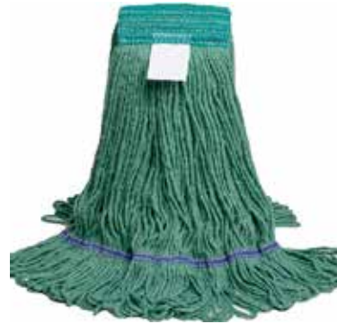
Green 100% Synthetic Healthcare Antimicrobial

Our Healthcare line of wet mops is made of 100% synthetic fibers and is antimicrobial treated for the healthcare industry. The offer of multiple colored yarns is a must for keeping them separated within the different departments in a Healthcare environment.