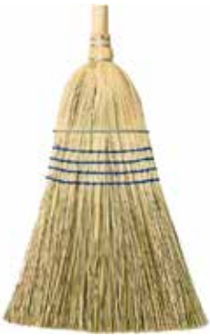
B404 Warehouse Broom

Quality broom for use in factories or warehouses. Each broom has one wire band for reinforcement. Clear natural finish wood handles. Each broom comes protected with a poly sleeve.