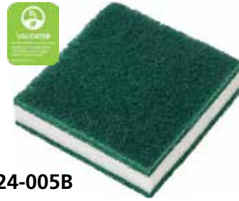
24-005B Tough-Scour Poly Soap Pad

This is ideal for commercial kitchen cleaning due to its three-layer construction. This palm-size pad consists of two abrasive scrubbing surfaces with a foam center and is filled with highly concentrated liquid detergent.