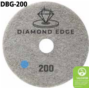
200 Grit Diamond Edge Pad

An aggressive diamond pad to be used on damaged floors or after grinding. For heavy-duty removal of scratches and discoloration of the surface.