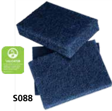
S088 Extra Heavy Duty Pot & Pan Blue Pad

A full 7/8" thick hand pad with extra heavy-duty abrasive. This Pot & Pan pad is made with a tough poly blend and an open weave construction to easily hold and release baked on foods. This pad easily tackles crusty equipment.