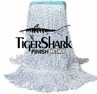
TigerShark Rayon Blend, Narrow-Band, Looped Finish Mop

This rayon blend, candy stripe mop holds more liquid. Excellent for applying floor finish. Looped-ends keep mops from fraying and linting. Tailband provides wide surface coverage without gaps while preventing tangles. Sewn-in label for easy identification and re-order. Each mop is individually packaged. Narrow-band is 1-1/4" vinyl coated mesh.