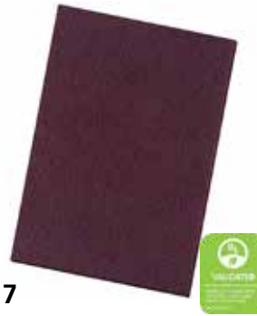
#617 All Purpose Maroon Hand Pad

Thick, tough, poly blend construction, heavy-duty abrasive. Rugged yet flexible. Perfect for corners and hard to reach areas. Use where heavy aggressive action is required. Item No Size Pk Case Wt Cu 86-606 6"x 9" 1/18 1.92# 0.26 S86 6"x 9" 6/10 5.5# 0.74 96-050 3-1/2"x 6" 1/60 1.50# 0.50