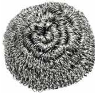
400 Series Stainless Steel