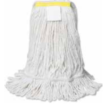
Rayon, Narrow-Band, Loope

Quick absorption, mildew resistant and fast-drying. 1-1/4" wide mesh headband for heavy cleaning. Looped-ends keep mops from fraying and linting. Tailband provides wide surface coverage without gaps while preventing tangles. Sewn-in label for easy identification and re-order. Each mop is individually packaged.