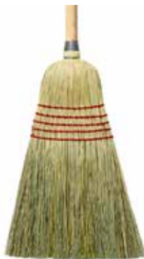
B412 Janitor, Natural Handle

For commercial to janitorial sweeping. This is the ideal broom for most general duty applications. Each broom has a gloss wood natural handle and is protected with a poly sleeve.