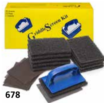
678 Griddle Screen Kit

Contents: 1 pkg. (20) Screens, (10) grill pads and (1) griddle pad holder. Griddle pad holder is manufactured with high heat resistant resins, so it won't melt or burn. Built to withstand heat up to 400°F. Gripping fingers hold pads firmly to holder.