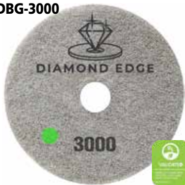
3000 Grit Diamond Edge Pad

The 3000 diamond pad produces and maintains a "wet-look" floor. Use it as your normal maintenance pad on concrete, stone, terrazzo, tile and even VCT.