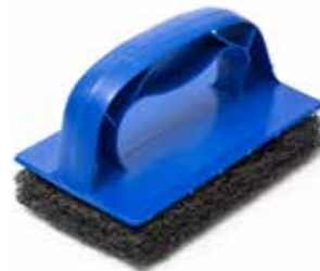
95370 Griddle Scrubber "One-Piece"

Tough, durable open weave pad cleans faster and lasts longer. Heat resistant handle is easy to use. Rinse clean for multiple uses.