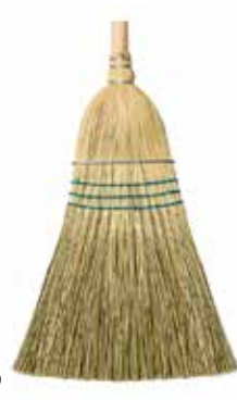
B406 Warehouse Broom

Quality broom for use in factories or warehouses. Each broom has one wire band for reinforcement. Clear natural finish wood handles. Each broom comes protected with a poly sleeve.