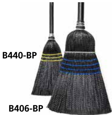
B440-BP B406-BP Crimped Polypropylene Brooms

Water, oils and most solvents do not affect synthetic fiber. These brooms are durable and long-wearing. Available in popular warehouse and lobby style. For those tough continuous cleaning conditions, this is the broom that will out last them all. Both come with gloss black wood handles. Each broom comes protected with a poly sleeve.