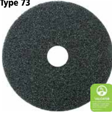
Emerald Hy-Pro Strip

Maximum abrasive content, tear resistant and long wearing. Wide open mesh construction allows solutions to flow through without loading and build up. Highly aggressive, 5/8" thick is the toughest of them all. Use with 175 – 300 RPM machines.