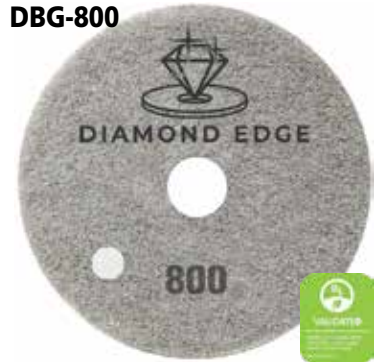
800 Grit Diamond Edge Pad

An intermediate diamond pad to be the first step for bringing back floors not maintained on a regular basis. This pad cleans and removes small scratches. Leaves a slightly reflective finish.