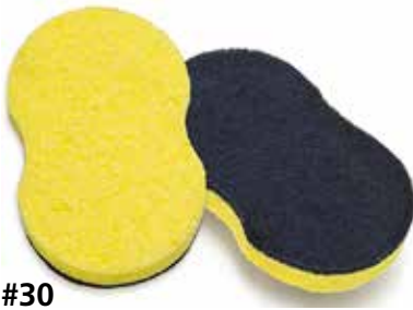
Cool Blue Scrubber Sponge

Cool Blue Sponge Contour size yellow cellulose with New Cool Blue Anti-microbial treated scratchless pad. Ideal for all-purpose cleaning. Outperforms and outlasts all others.