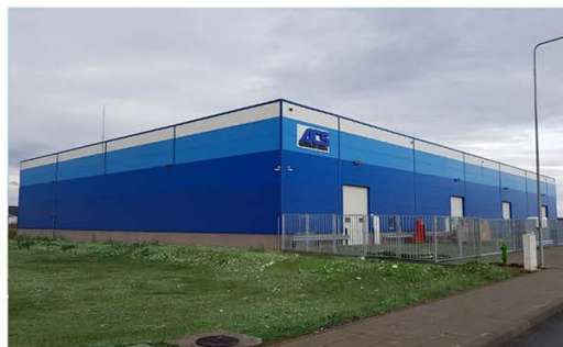
ACS Industries Europe SRL Trascaului No. 6 Turda, Romania