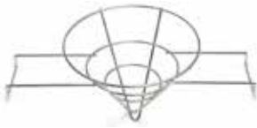
AFCH1 10" Cone Holder