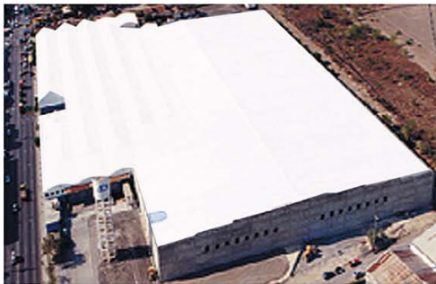
ACS Internacional S. de R.L. de C.V. Guadalupe, Mexico Plant # 2