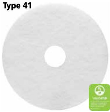
Type 41 White Polishing