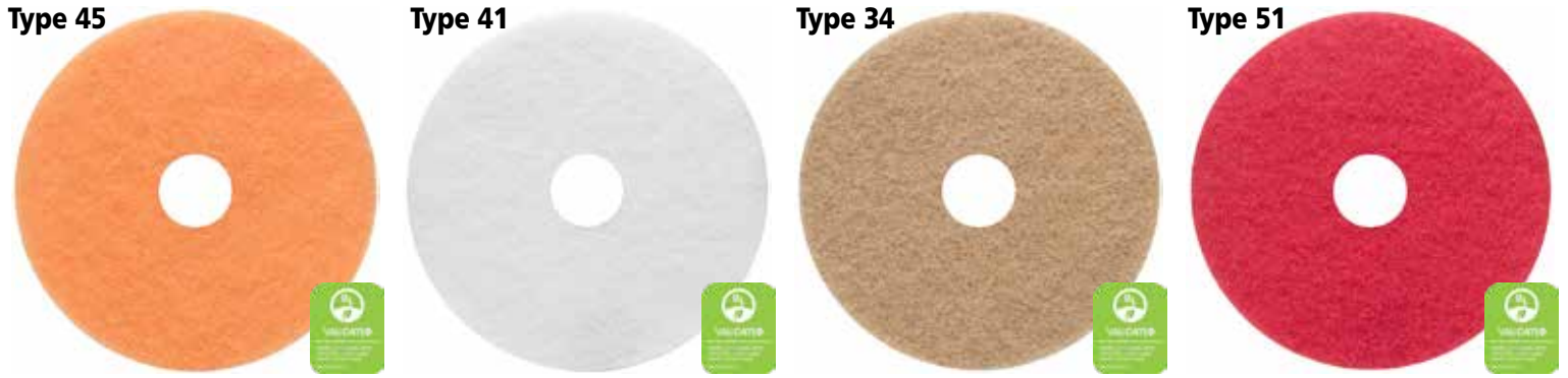
Type 45 Peach Burnishing HS Auto Scrub