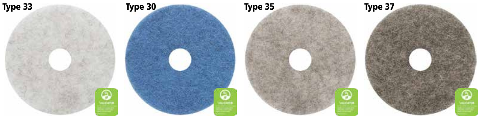
Natural Blend Light

A controlled blend of polyester and natural hair fibers makes this a versatile UHS pad. The lubricating effect of natural hair produces the wet look with soft finishes while providing strength and durability. Use with machines up to 3000 RPM.