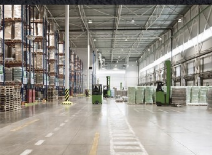
COMMERCIAL & MANUFACTURING