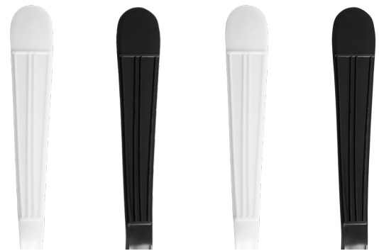
E177 SERIES E179 SERIES E187 SERIES E189 SERIES