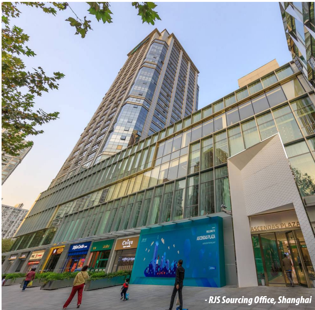
- RJS Sourcing Office, Shanghai