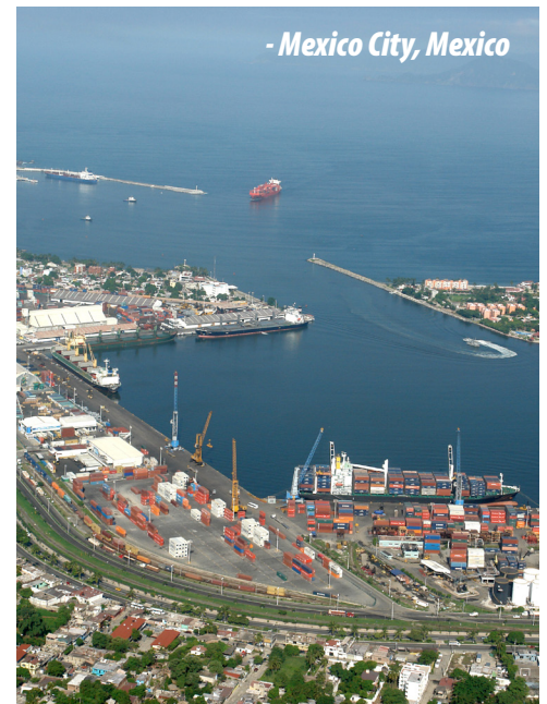
- Mexico City, Mexico

Factories are producing product for us in Mexico, Columbia, and Ecuador. The push for expansion in Central and South America allows for improvement in shipping transit times, and allows us to hedge any potential geopolitical disruption in traditional supply markets in the unforeseen future.