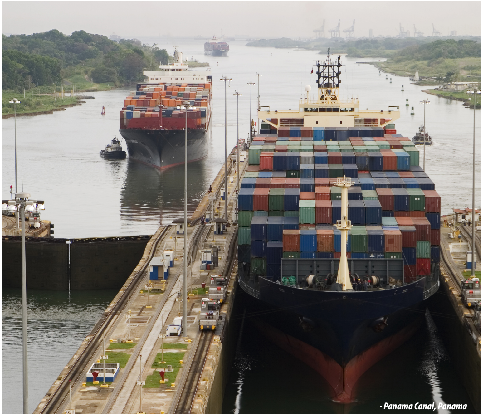
- Panama Canal, Panama