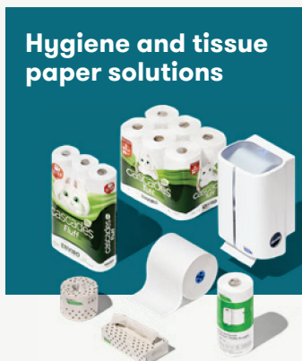
Hygiene and tissue paper solutions