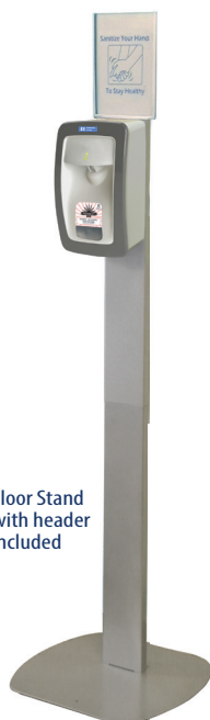
Floor Stand with header included