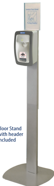
Floor Stand with header included