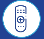
Remote Controls 2