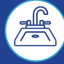
Sinks & Faucets