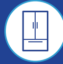
Breakroom Appliance Handles