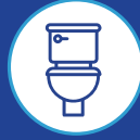
Flush Handles & Toilet Seats