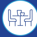
Counters & Tables 1