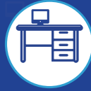
Desks & Chairs