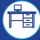
Desks & Chairs