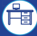
Desks & Chairs