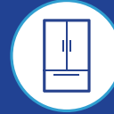
Breakroom Appliance Handles