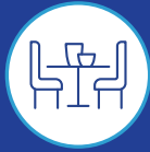
Counters & Tables 1