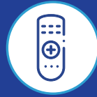
Remote Controls 2