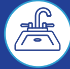
Sinks & Faucets