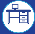
Desks & Chairs