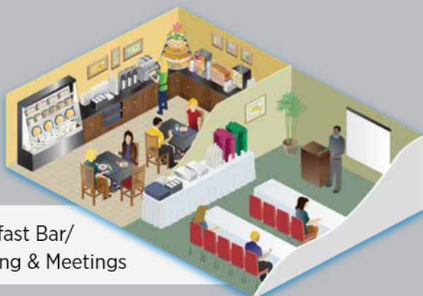
Breakfast Bar/ Catering & Meetings