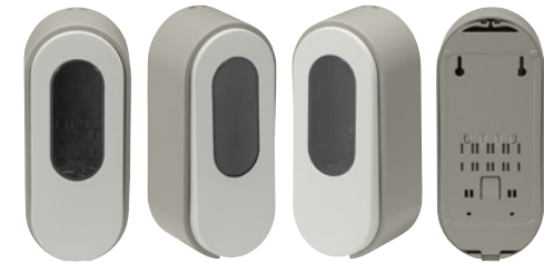
Dial® Versa™ Dark Gray/Light Gray Cartridge Bottle Refill Dispenser