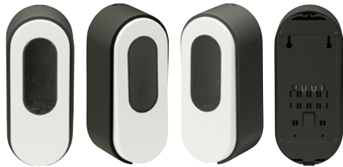
Dial® Versa™ Black/White Cartridge Bottle Refill Dispenser