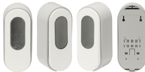
Dial® Versa™ Light Gray Cartridge Bottle Refill Dispenser