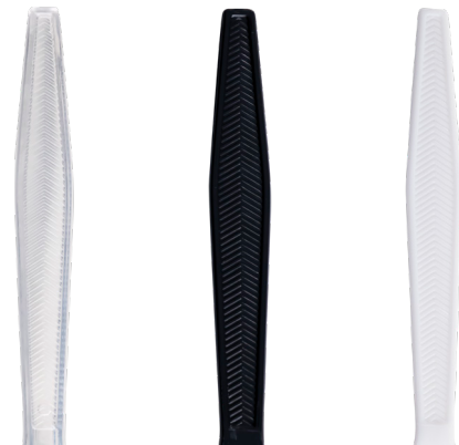
E184 SERIES E188 SERIES E187 SERIES