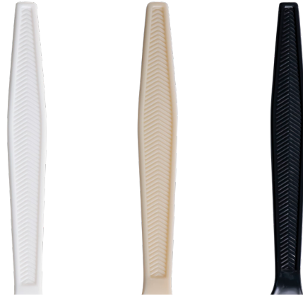
E181 SERIES E182 SERIES E183 SERIES