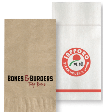
Kraft / Linen-Like Quickset®