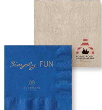
Navy / Linen-Like Natural® Sand