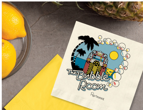
Ecru Beverage Napkin - Digital