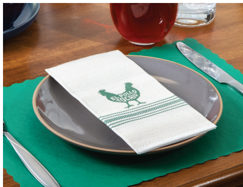
FashionPoint® Dinner Napkin