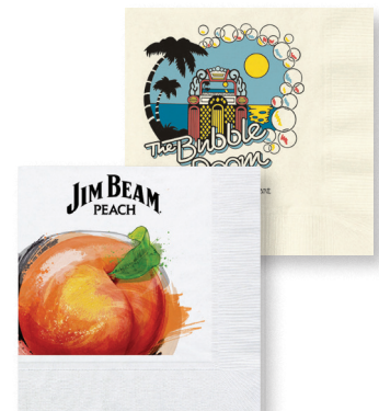
White / Ecru