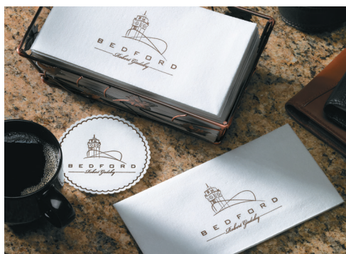
Linen-Like® Guest Towel