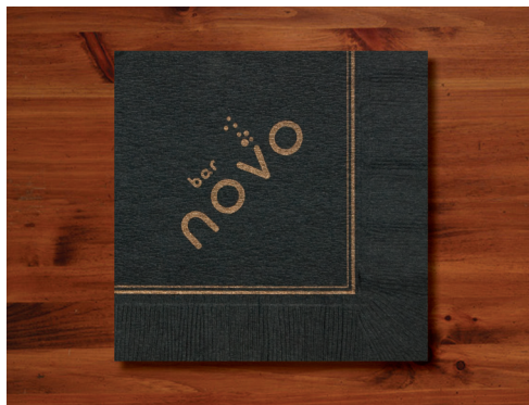
Black Beverage Napkin