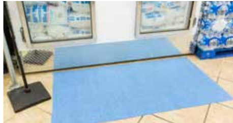
Adhesive strength will not diminish even when wet