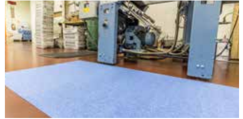
Use near machinery to avoid employee slips, trips, and falls