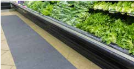
A fast-drying solution in areas where water and moisture can drip or accumulate