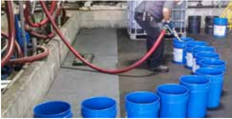
Matting absorbs both oil- and water-based liquids to keep your workplace clean