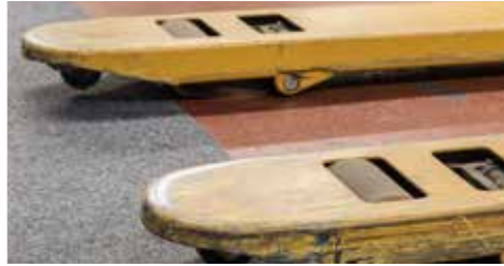
Stays put in warehouses and plant floors in heavy forklift, pallet jack, and foot traffic