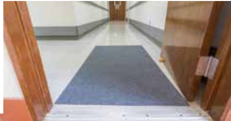
Place at transition areas to mitigate tracking dirt to front of house