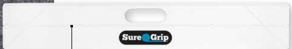
Sure Grip® Cutting Guide for custom sizes, helps ensure a straight cut, while protecting floors underneath.