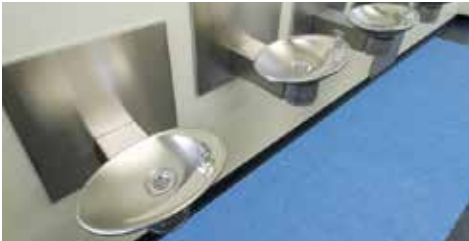
Protect from slipping and falling near sinks and drinking fountains