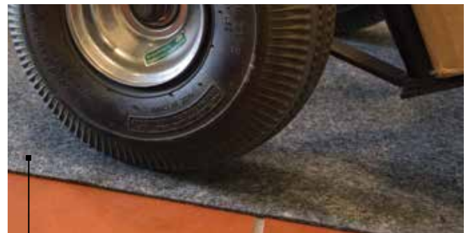
Sure Grip® allows wheels from carts, forklifts and pallet jacks to easily glide over the surface, keeping the matting secure.