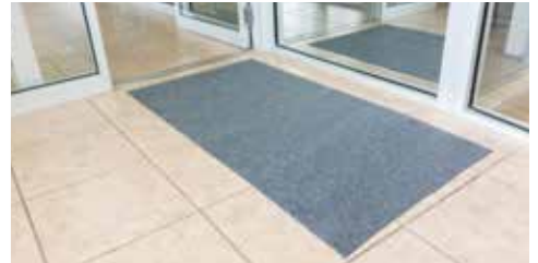
Great entry/exit matting that will not move or shift under shopping carts