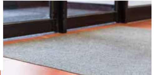
Replace costly rental mat services with an inexpensive and disposable option