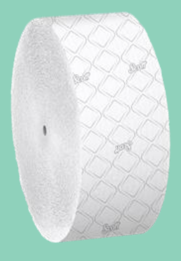
Scott Essential® Coreless Jumbo Roll Tissue (07006)