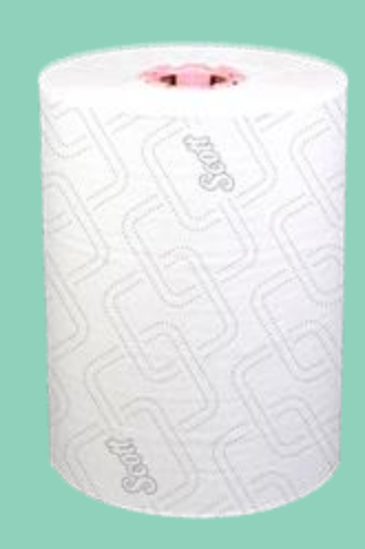
Scott<sup>®</sup> Control Slimroll<sup>™</sup> Towels (47032/47035)