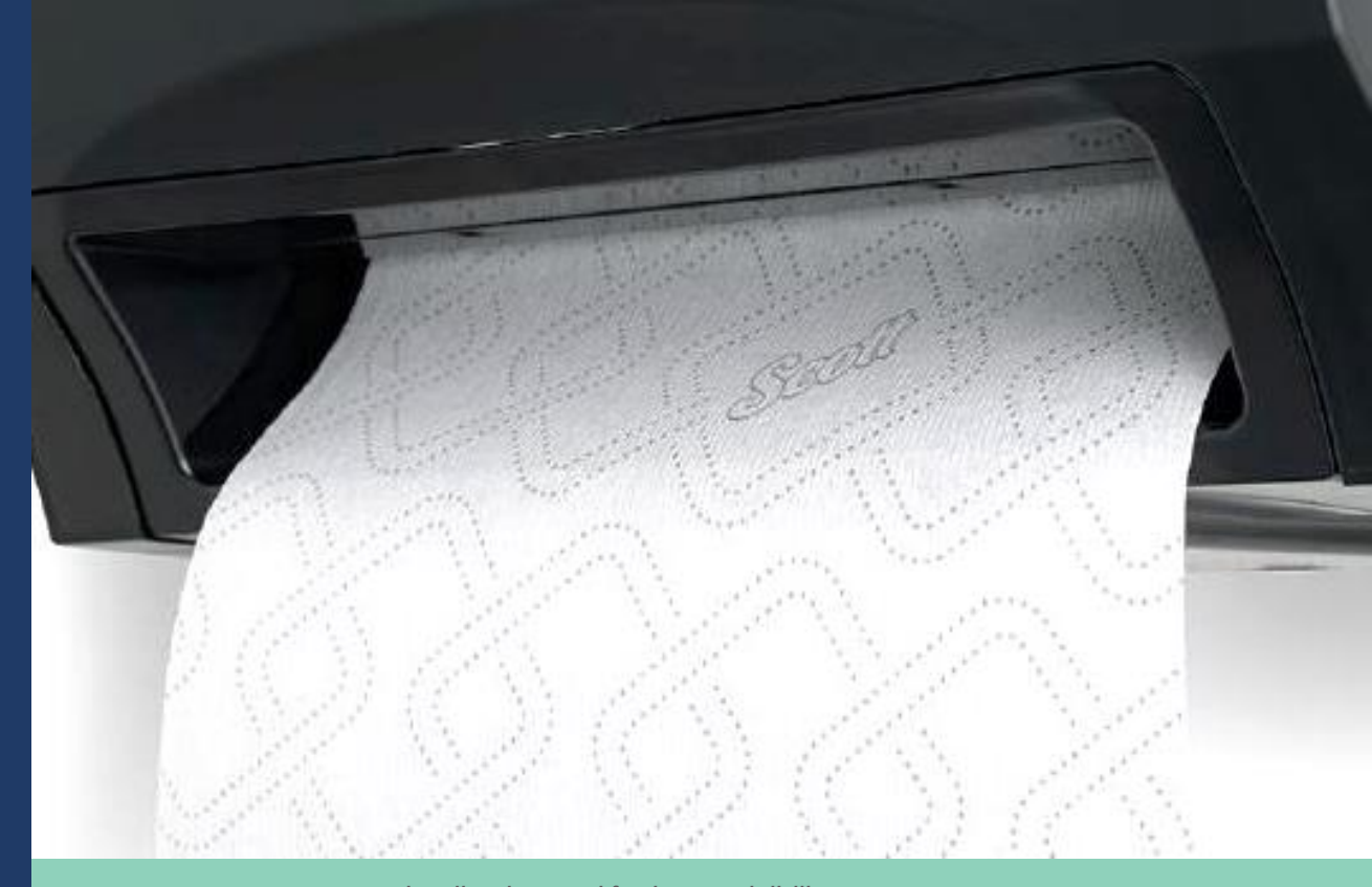
pattern detail enhanced for better visibility on screen

We're making our mark – it's unmistakably Scott<sup>®</sup>.