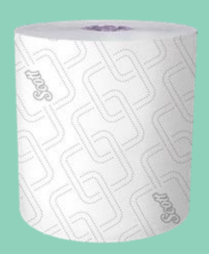
Scott<sup>®</sup> Essential High Capacity Hard Roll Towels (02001)