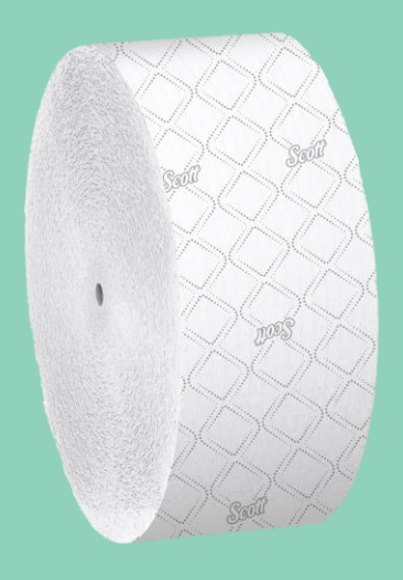
Scott Essential® Coreless Jumbo Roll Tissue (07006)