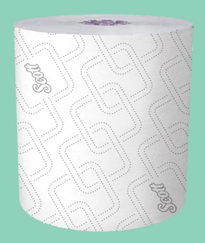
Scott<sup>®</sup> Essential High Capacity Hard Roll Towels (02001)