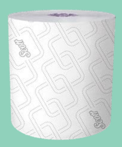
Scott<sup>®</sup> Essential High Capacity Hard Roll Towels (02001)