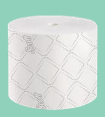
Scott Pro® Paper Core, SRB Tissue (47305)