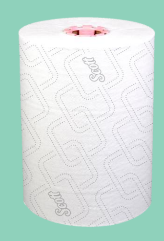
Scott<sup>®</sup> Control Slimroll<sup>™</sup> Towels (47032/47035)