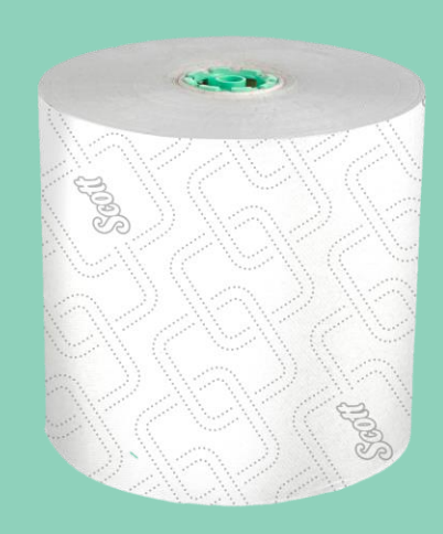
Scott<sup>®</sup> Pro High Capacity Hard Roll Towels 1150' (25700/25702/25703)