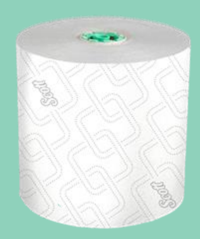
Scott<sup>®</sup> Pro High Capacity Hard Roll Towels 1150' (25700/25702/25703)