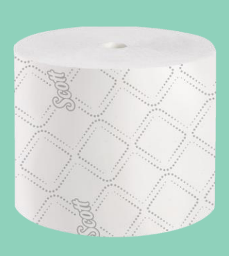
Scott Pro® Paper Core, SRB Tissue (47305)