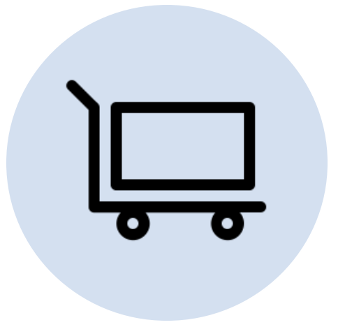
REQUEST PRODUCT SAMPLES