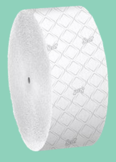
Scott Essential® Coreless Jumbo Roll Tissue (07006)