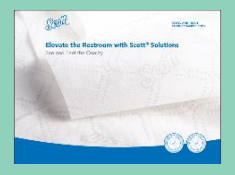
Product Sample Swatch book