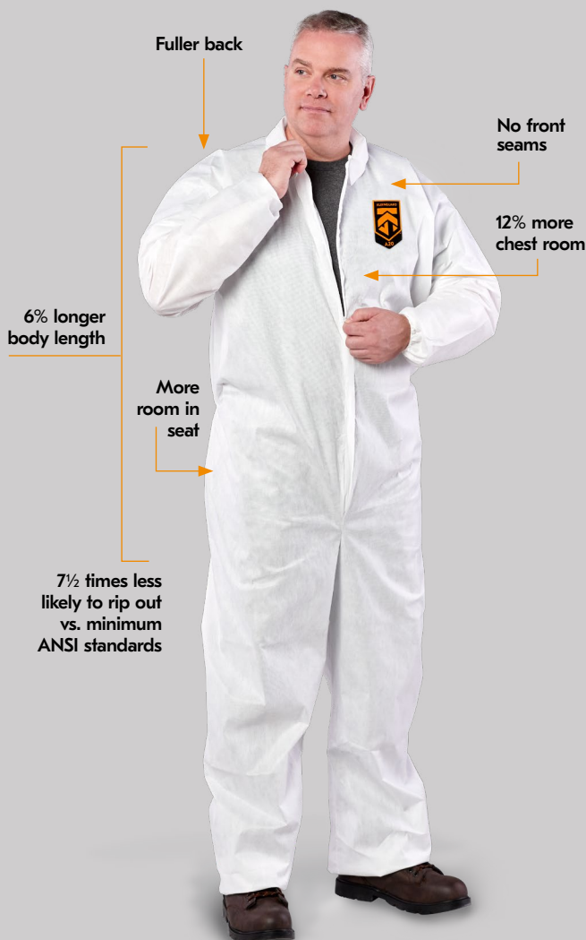
KleenGuard™ Coverall with Reflex® Design (Available in A20, A30, A40, A45, A60, A70 and A80 Coveralls)