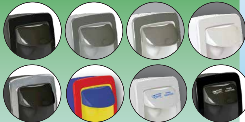
Imprinted with Health Guard Hand Sanitizer