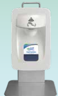
Counter Top Stand (dispenser not included)

Batteries included – resulting in more than 30,000 dispenses!