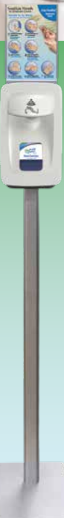
Hand Hygiene Floor Stand Includes Steps to Hand Sanitizing sign (dispenser not included)

Customization available with the DECO dispenser