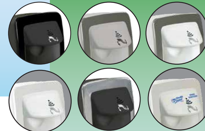
Imprinted with Health Guard Hand Sanitizer