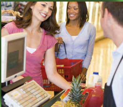
Reduce germs in customer service areas