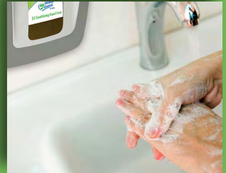
Make hand hygiene a priority in restrooms