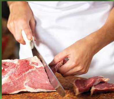
Prepare and serve food with clean hands