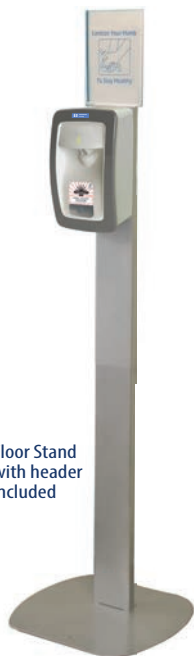
Floor Stand with header included