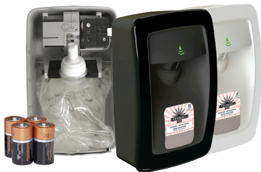
No-Touch M-Fit Dispensers Uses (4) C Batteries