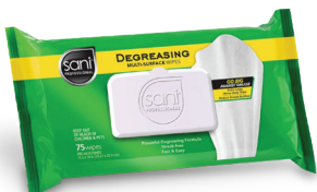
Degreasing Multi-Surface Wipes 75-CT. (A12345)