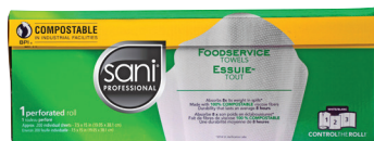
Dry Foodservice Towels 200-CT. (G125DA)