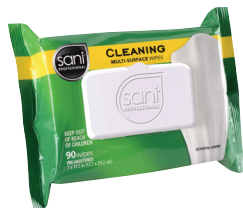
Cleaning Multi-Surface Wipes 90-CT. (A580FW)