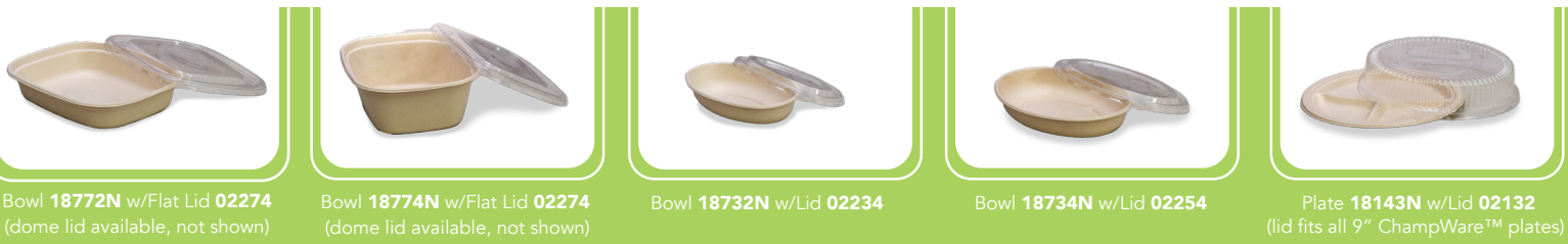
Bowl 18772N w/Flat Lid 02274 (dome lid available, not shown)

These new item additions to our existing product line help provide your customers with the best reusable, renewable, and biodegradable options. Natural ChampWare™ products are naturally sourced using bagasse, a fibrous by-product of the sugarcane refining process. All Natural ChampWare™ items are recyclable and compostable in the limited areas where facilities exist. These items are moisture and grease resistant and the natural color makes a sustainable statement to your customers. The sturdy design provides a much stronger option than competitive products. Contact your sales rep for more information.