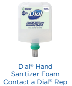
Dial® Hand Sanitizer Foam Contact a Dial® Rep