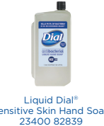
Liquid Dial® Sensitive Skin Hand Soap 23400 82839