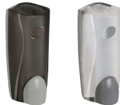
1 Liter Dial® Manual Liquid Dispenser (Smoke dispenser) 23400 03922 (Ice dispenser) 23400 03920