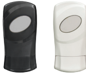
1.2 Liter Dial® FIT® Manual Dispenser Available in Slate and Ivory