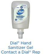
Dial® Hand Sanitizer Gel Contact a Dial® Rep