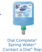
Dial Complete® Spring Water® Contact a Dial® Rep