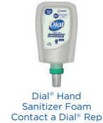
Dial® Hand Sanitizer Foam Contact a Dial® Rep