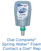
Dial Complete® Spring Water® Foam Contact a Dial® Rep