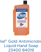
Dial® Gold Antimicrobial Liquid Hand Soap 23400 84019