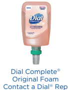
Dial Complete® Original Foam Contact a Dial® Rep