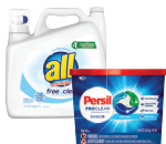
all® Free & Clear Liquid 72613 46159 Persil Pro Clean Disc 24200 04173