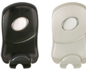
1.7 or 1.2 Liter Dial® 1700 Manual Dispenser Available in Smoke and Pearl