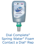
Dial Complete® Spring Water® Foam Contact a Dial® Rep