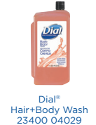
Dial® Hair+Body Wash 23400 04029