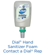
Dial® Hand Sanitizer Foam Contact a Dial® Rep