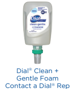
Dial® Clean + Gentle Foam Contact a Dial® Rep