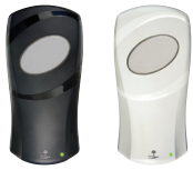
1 Liter Dial® FIT® Touch-Free Dispenser Available in Slate and Ivory