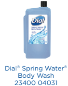
Dial® Spring Water® Body Wash 23400 04031